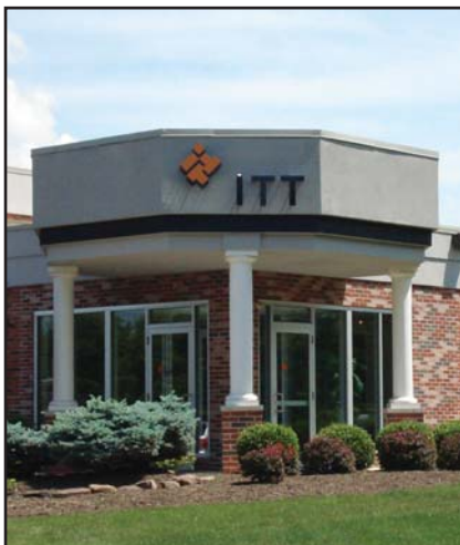
Cleveland Motion Controls Cleveland, OH

ITT is a vibrant part of the global economy. We are a high-technology engineering and manufacturing company with approximately 40,000 employees operating in 55 countries. Our portfolio of businesses is aligned with enduring global growth drivers, and our employees bring extraordinary focus to meeting the needs of the people who buy and use our products and services in all the markets we serve.