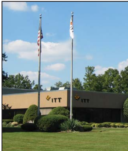
ITT Enidine Inc. Orchard Park, NY