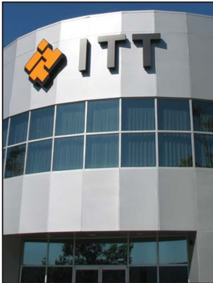
Control Technologies Headquarters Valencia, CA